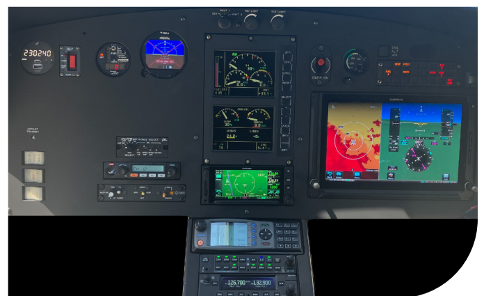
instrument panel upgrade